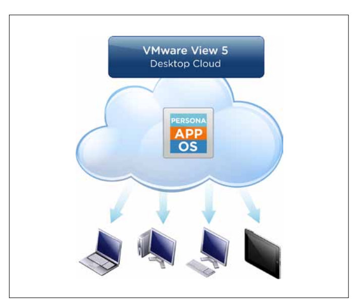
VMware View improves desktop and application management by delivering desktop services from your cloud to enable end users over any network on any device.

Enable a seamless end-user experience across sessions by maintaining the user persona with faster login times. View Persona Management also reduces costs by enabling more cost-efficient, stateless floating desktops.